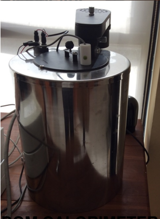
BOM CALORIMETER T'604/TOSHNIVAL