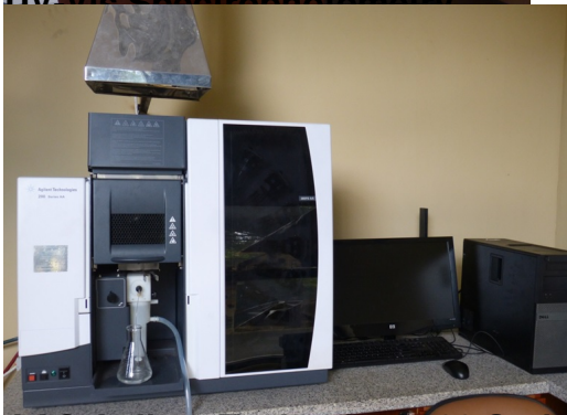
AAS Agilent Teknologi 200 Series AA